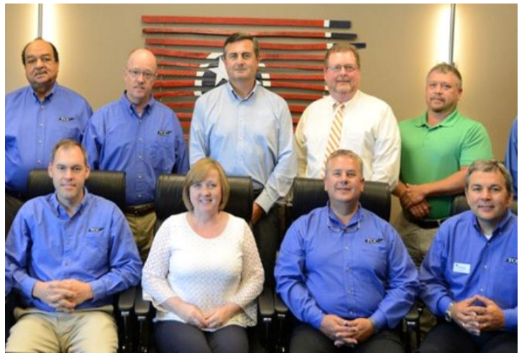
2019 TCC Board of Directors

Happy Summer 2019 to you, and welcome to our 1 st edition of the TCC quarterly newsletter! In our newsletters, you will find featured articles of events and activities taking place throughout the year, meet our yearly scholarship recipients, learn more about your local cooperatives, and much more!